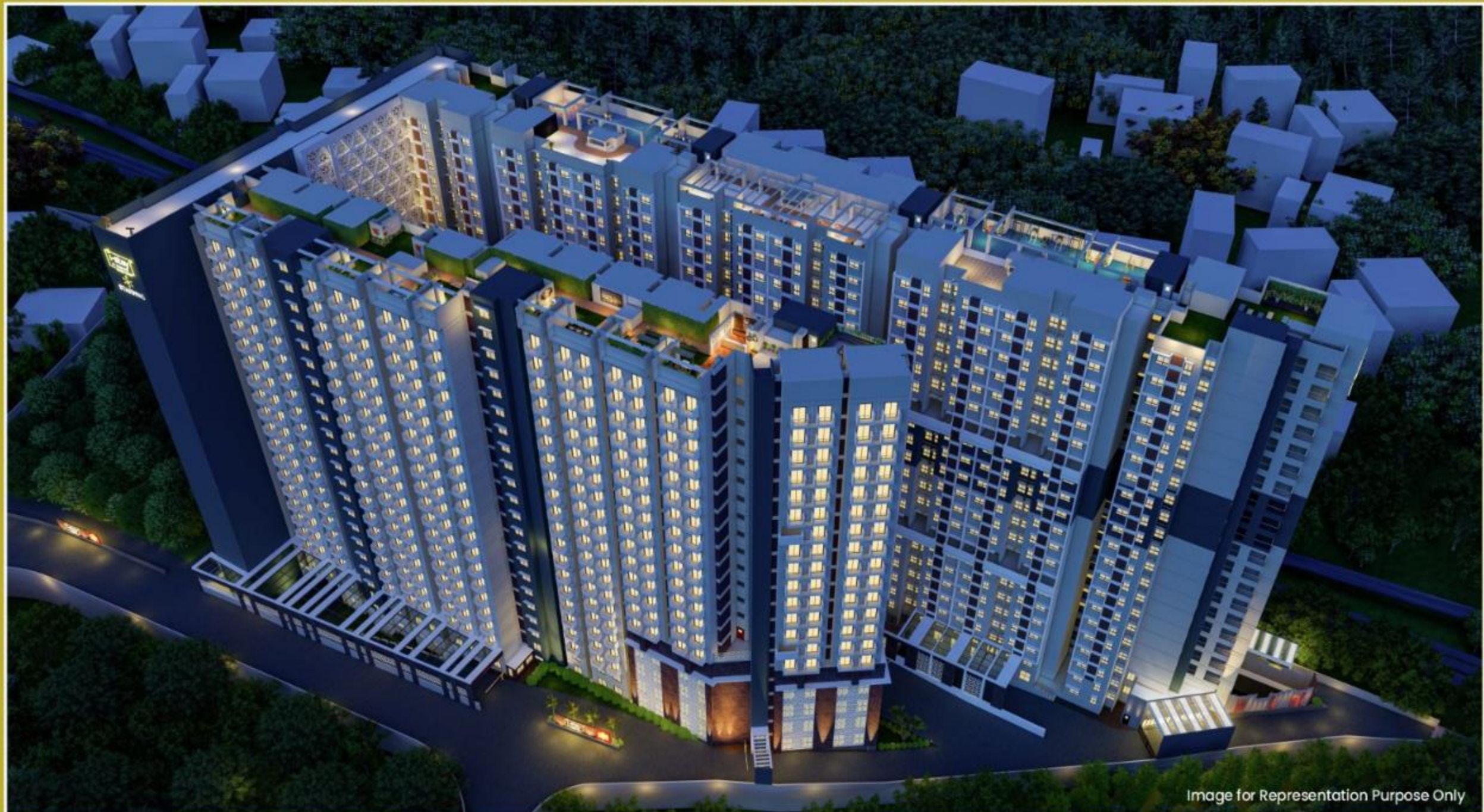
Image for Representation Purpose Only